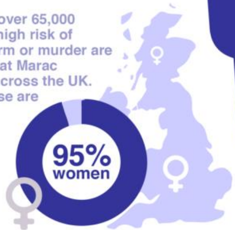
SafeLives Marac data June 2018 to June 2019

Each year over 65,000 victims at high risk of serious harm or murder are discussed at Marac meetings across the UK. 95% of these are women